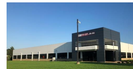
19-23 S. Premier Dr, Fenton MO 63026

4,900 SF office suite available fronting Ladue Rd with building signage opportunity. Functional layout in attractive one-story brick building with ample parking. Located just north of the high profile intersection of Ladue Rd and Lindbergh Blvd.