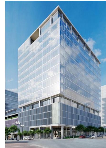
Commerce Bank Tower 8001Forsyth Blvd, Clayton MO 63105