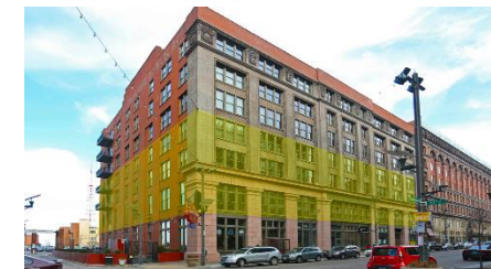
1227 Washington Ave, St. Louis MO 63103

Now leasing for Class A+ new Clayton office tower located at the corner of Forsyth Blvd and Meramec Ave. Up to 78,000 SF available on mid-floors of the 15-story office building, delivering in 2022. Attached covered parking and on-site visitor parking. Includes expansive garden terrace on the rooftop of the parking garage with outdoor meeting areas, dining space and fire nooks.