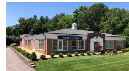
10324 Ladue Rd, Creve Coeur MO 63141

Approx. 70,000 SF of contiguous, furnished office space across three floors (can be demised to as small as 8,000 SF; numerous other size options available) available for sublease. High-end creative finishes, exposed ceilings, concrete floors, and floor to ceiling interior glass walls.