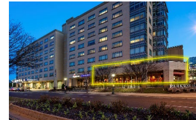
4550 Forest Park Ave St. Louis, MO (Central West End)