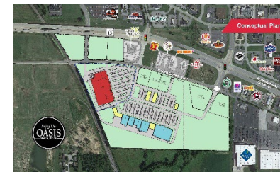
Oasis South Shopping Center Marion, IL