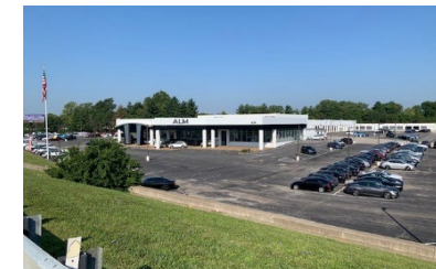
820-830 James S. McDonnell Blvd Hazelwood, MO