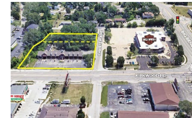
920 S. Kirkwood Rd Kirkwood, MO