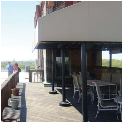
Roof Sun Deck