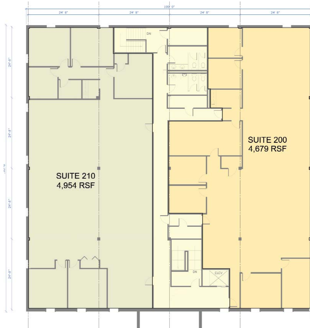
SECOND FLOOR PLAN SCALE: 1/8" = 1'-0"

4433 Woodson Rd, Woodson Terrace MO 63134